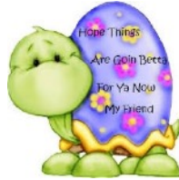
SOMEONE NEED CHEERING? PLEASE TELL COLETTE DEGENHARDT